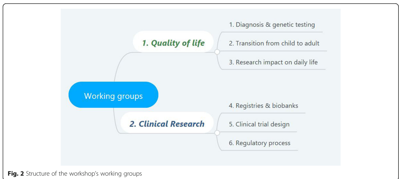
Fig. 2 Structure of the workshop’s working groups

The terminology used in this paper refers to the National Institute for Health Research (UK) definitions [22] namely: